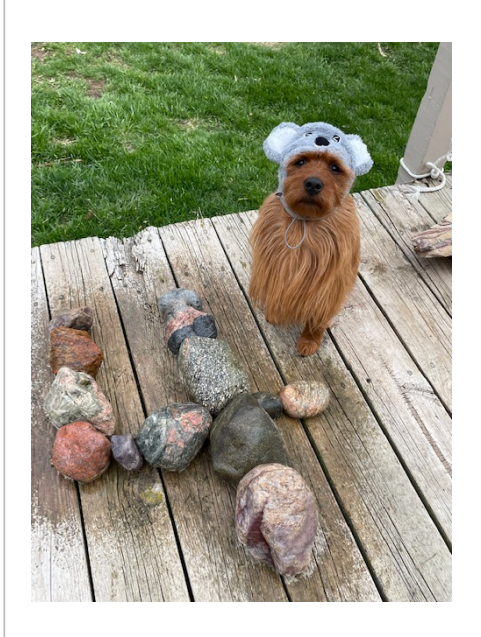
Can you BELIEVE my mom put this koala bear hat on me?!