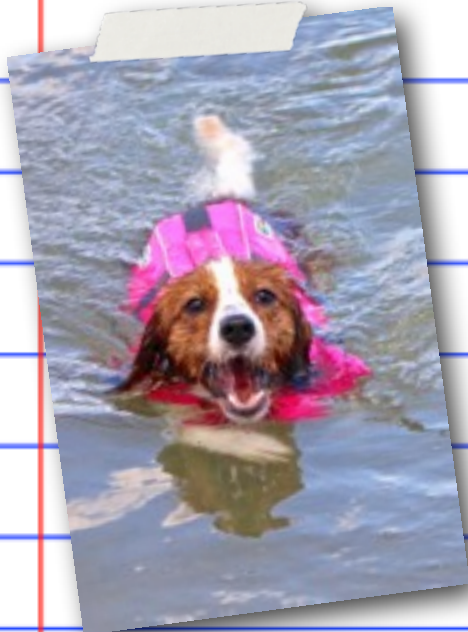
Reeze learned how to swim!