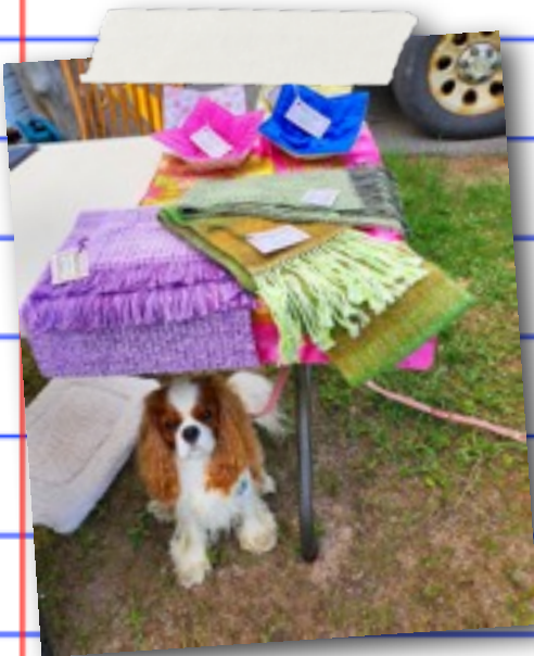
Stuart went to yard sales!