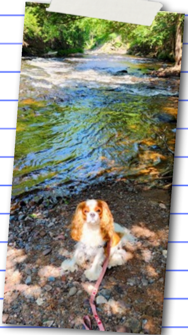
Stuart went for hikes!