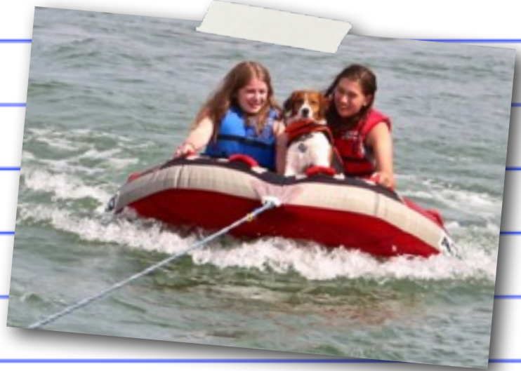
Gib2 on went tubing!